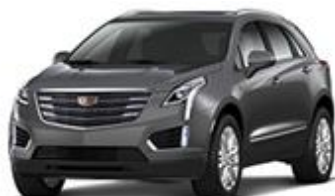
Dark Granite Metallic