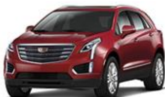
Red Passion Tintoat