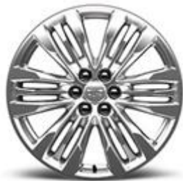
20" aluminum wheels with Sterling Silver premium-painted finish