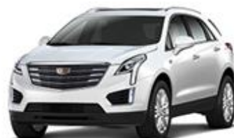
Crystal White Tricoat