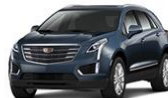
Harbor Blue Metallic