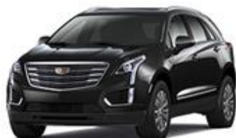
Stellar Black Metallic